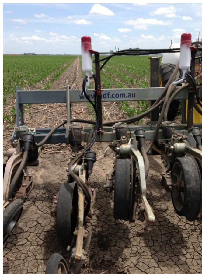
Side dressing: Single disc with anhydrous.