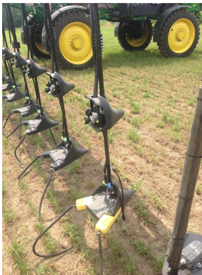
Liquid side dress applicator.

For irrigated crops and high yield potential dryland crops, a three-way split, with a portion of the N being applied at the V6 and VT stages provides added flexibility to match N supply to yield potential later in the season. Irrigation method and frequency will have an effect on the root density and distribution in the soil profile. Frequent surface applied irrigation i.e. centre pivot or lateral can encourage a higher density of root growth in the surface layers, compared to limited irrigated or rain grown crops. Placement and timing of N needs to be matched to the available water profile.