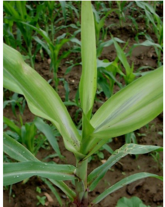
Zinc deficiency in corn.

Similar to P, Zn uptake is affected by a range of soil and climatic factors. The effect of fallow length and the crop sequence on VAM being very important. Long clean fallows and corn following canola greatly increase the risk of Zn deficiency. Other factors that increase chances of Zn deficiency include cool soil temperature at planting, alkaline soils and high soil availability of P. Effective early Zn nutrition can require multiple application strategies in a single crop in some soils and seasons.