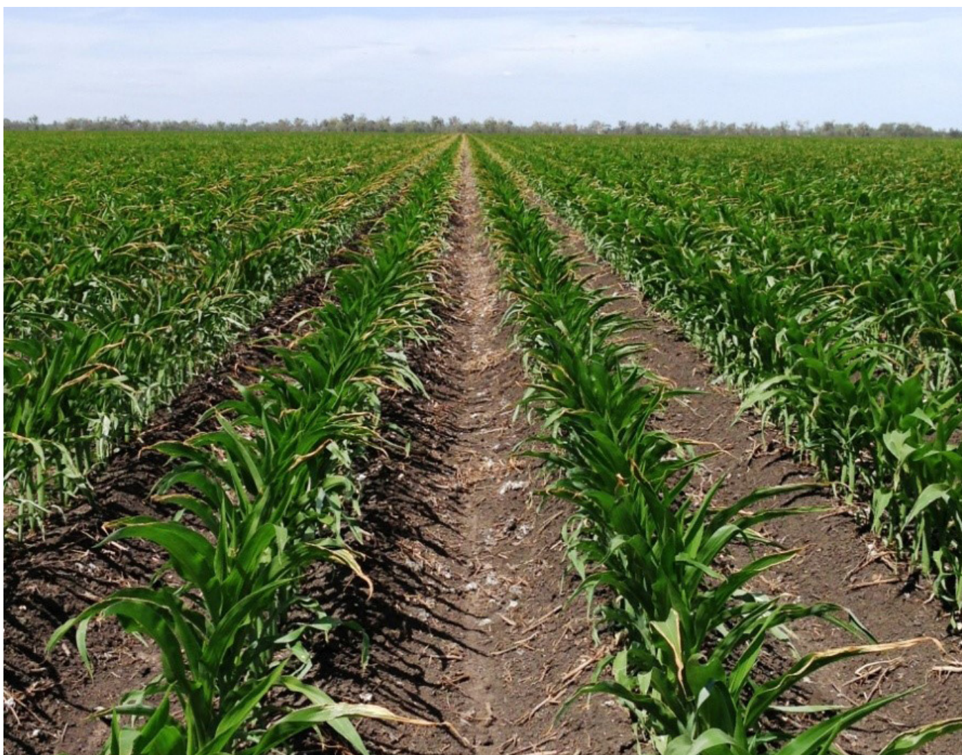
Leaf burn caused by volatilisation of ammonia from unincorporated urea (12 hours).

Anecdotal evidence suggests that for broadcast application, rates of urea should be kept below 100kg/ha when crops are between growth stages 2 and 3 in a single application to lower the risk of fertiliser burn in the centre whorl.