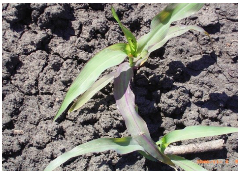
P deficient corn.

In soils where response to deep P is likely, timing of the application should allow for reconsolidation of the seedbed by moisture i.e. at the start or a fallow when there is soil moisture to 20 – 30cm depth.