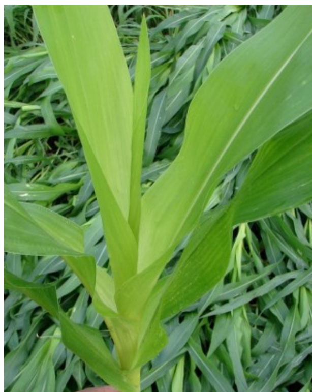
S deficiency in corn.

Sulphur requirement in the plant is parallel to N so the range of application timing options are the same as for N.