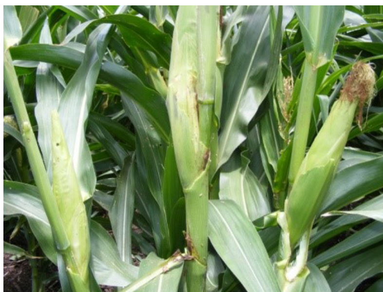
Double cobbing corn, typical of some hybrids planted at low populations.

Minor variations to this pattern may result from differences in the degree of multiple cobbing between varieties. Multiple cobbing generally extends the uptake period for all nutrients.