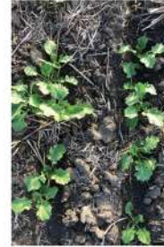
High Monza® Residue

Stage: Summer 4 MBS Spinnaker ® 70g/ha Hasten ® 500ml/100L Stage: IBS Rustler ® 1L/ha Stage: PSPE TT 1.1kg/ha Stage: Post Em (4-6Leaf) TT 1.1kg/ha Select ® 500ml/ha Uptake ® 0.5%