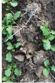
High IMI Residue

Stage: Summer 4 MBS Intervix ® 375ml/ha Stage: IBS Rustler ® 1L/ha Stage: PSPE TT 1.1kg/ha Stage: Post Em (4-6Leaf) TT 1.1kg/ha Select ® 500ml/ha Uptake ® 0.5%