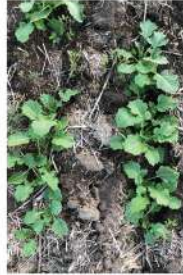
Low IMI Residue

Stage: Summer 4 MBS Intervix ® 375ml/ha Stage: IBS Rustler ® 1L/ha Stage: PSPE TT 1.1kg/ha Stage: Post Em (4-6Leaf) TT 1.1kg/ha Select ® 500ml/ha Uptake ® 0.5%