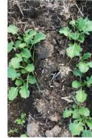
High Alty® Residue

Stage: Summer 4 MBS Glean ® 15g/ha Wetter 1000 100ml/100L Stage: IBS Rustler ® 1L/ha Stage: PSPE TT 1.1kg/ha Stage: Post Em (4-6Leaf) TT 1.1kg/ha Select ® 500ml/ha Uptake ® 0.5%