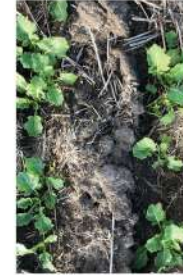
Standard TT Control

Stage: 10 DBS Alty ® 5g/ha Wetter 1000 100ml/100L Stage: IBS Rustler ® 1L/ha Stage: PSPE TT 1.1kg/ha Stage: Post Em (4-6Leaf) TT 1.1kg/ha Select ® 500ml/ha Uptake ® 0.5%