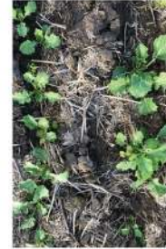
High Logran® Residue

Stage: Summer 4 MBS Monza ® 20g/ha DCTrate ® 2L/100L Stage: IBS Rustler ® 1L/ha Stage: PSPE TT 1.1kg/ha Stage: Post Em (4-6Leaf) TT 1.1kg/ha Select ® 500ml/ha Uptake ® 0.5%