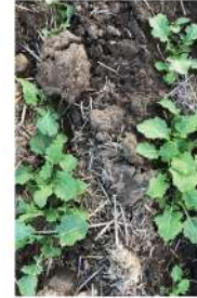
High Glean® Residue

Stage: Summer 4 MBS Logran B-Power ® 50g/ha Hasten ® 500ml/100L Stage: IBS Rustler ® 1L/ha Stage: PSPE TT 1.1kg/ha Stage: Post Em (4-6Leaf) TT 1.1kg/ha Select ® 500ml/ha Uptake ® 0.5%