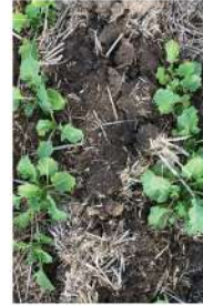
High Spinnaker® Residue

Stage: Summer 4 MBS Raptor ® 45g/ha Hasten ® 500ml/100L Stage: IBS Rustler ® 1L/ha Stage: PSPE TT 1.1kg/ha Stage: Post Em (4-6Leaf) TT 1.1kg/ha Select ® 500ml/ha Uptake ® 0.5%