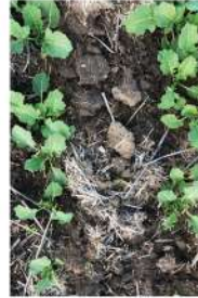
High OnDuty® Residue

Stage: Summer 4 MBS Intervix ® 750ml/ha Stage: IBS Rustler ® 1L/ha Stage: PSPE TT 1.1kg/ha Stage: Post Em (4-6Leaf) TT 1.1kg/ha Select ® 500ml/ha Uptake ® 0.5%