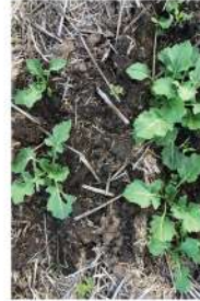
High Raptor® Residue

Stage: Summer 4 MBS OnDuty ® 40g/ha Hasten ® 500ml/100L Stage: IBS Rustler ® 1L/ha Stage: PSPE TT 1.1kg/ha Stage: Post Em (4-6Leaf) TT 1.1kg/ha Select ® 500ml/ha Uptake ® 0.5%