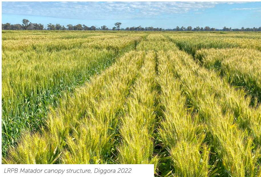
LRPB Matador canopy structure, Diggora 2022