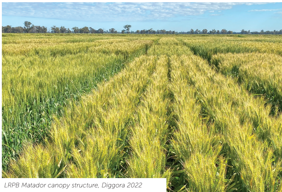
LRPB Matador canopy structure, Diggora 2022